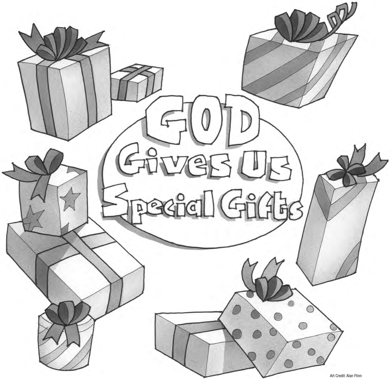
Art Credit: Alan Flinn